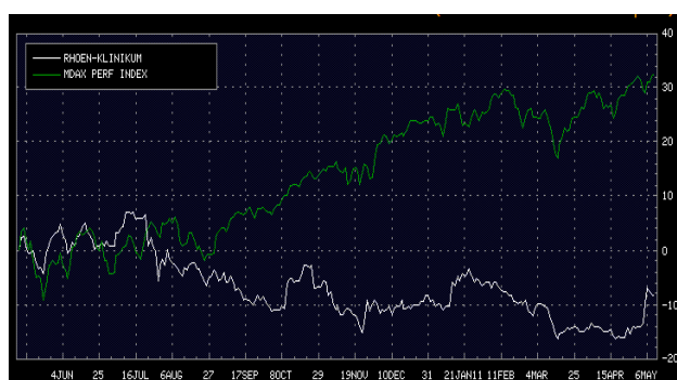
Rhön klinikum vs MDAX 1 year, Source: Bloomberg

But from another hand the decrease of CAPEX in the next years should improve company's earnings quality, as mentioned above free cash flow in 2012 are expected to be positive. Close Brothers Seydler Research rates the stock with PT EUR 18.0 and BUY recommendation.