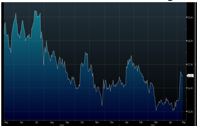
Rhön klinikum 1 year

At the end of April Rhön Klinikum (Rhön) has published its FY 2010 as well as 1Q/2011 figures.