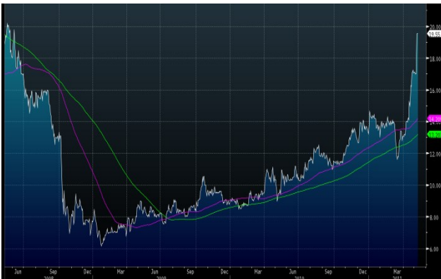
elexis AG, 3 years, Source: Bloomberg

TecDAX is nearing the 2011 highs which have been reached after the Fukushima disaster. Some disappointing figures from renewable companies had no effect on the index.