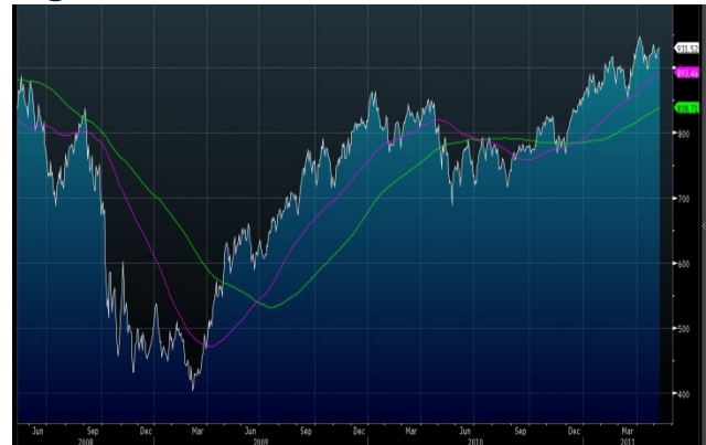
TecDAX, 3 Years

So far, investor obviously are obviously not tending to “Sell in May”. The DAX currently is trading close to its yearly high. The overall good mood keeps the short time uptrend intact.