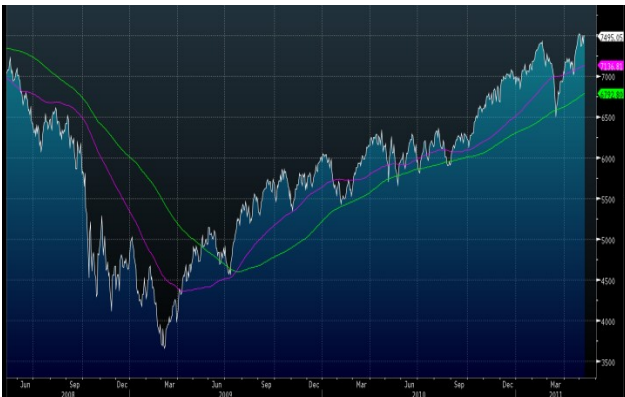
DAX, 3 Years

So far, investor obviously are obviously not tending to “Sell in May”. The DAX currently is trading close to its yearly high. The overall good mood keeps the short time uptrend intact.