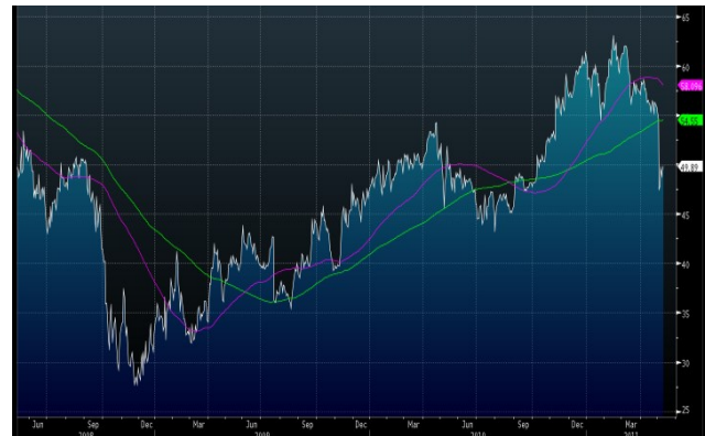
Wincor Nixdorf AG, 3 Years, Source: Bloomberg

Shareholders of SDAX listed Elexis group can pop some corks. A takeover offer of the SMS group for EUR 19 per share led to a further jump of Elexis’ share price.